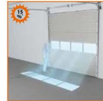
Lots of light and great visibility

ISO sectional doors can be fitted with Plexiglas windows for increased natural light and improved visibility. The standard windows are oblong, with straight or rounded corners containing single or insulating double glazing. For additional security against intruders, narrow rectangular windows with rounded corners are also available. Are you looking for a one-of-a-kind design? Then go for the rounded windows or a creative pattern made up of windows.