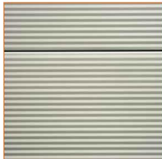
Micro-profiling, it's the standard!

The ISO 40 mm sectional door is Alpha's most popular door, a modern design that unifies excellent thermal insulation and sound-absorbing qualities in its micro-profiled panels. The choice of design and materials are endless, which means the door can always be perfectly configured to meet your wishes. Numerous types of built-in windows as well as different heights and widths make up the ISO 40 mm range, as well as a wide variety of Alpha's in-house RAL colours.