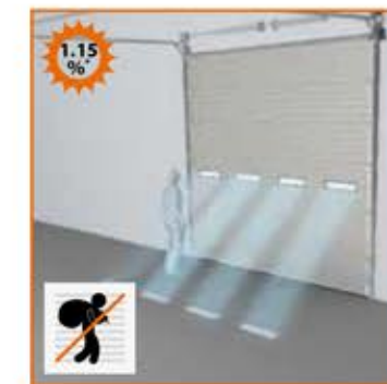
Narrow, burglar-proof windows