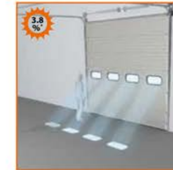
Rounded corners (r=120 mm), excellent insulative value