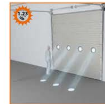
Attractive round windows