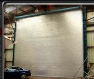
THERMAL BREAK INSULATED ROLLER SHUTTER