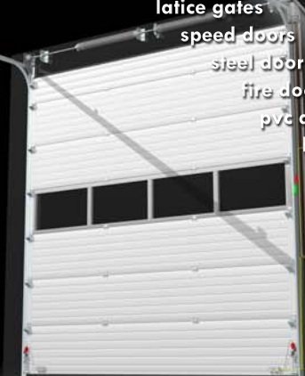
THERMAL BREAK INSULATED SECTIONAL DOOR