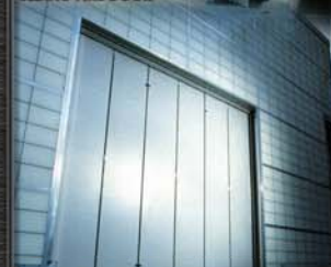
THERMAL BREAK FOLDING DOOR