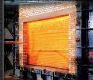
4 HOUR FIRE SHUTTER UNDER TEST