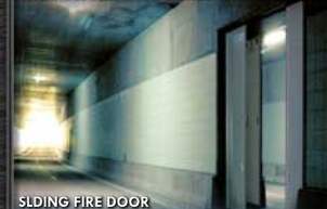
SLIDING FIRE DOOR