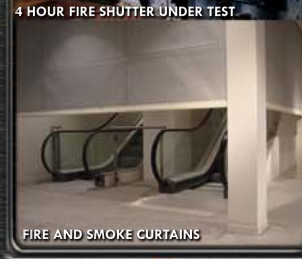
FIRE AND SMOKE CURTAINS